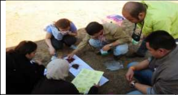
Picture 1: The trainers examine the type of soil and classify it according to the manual given