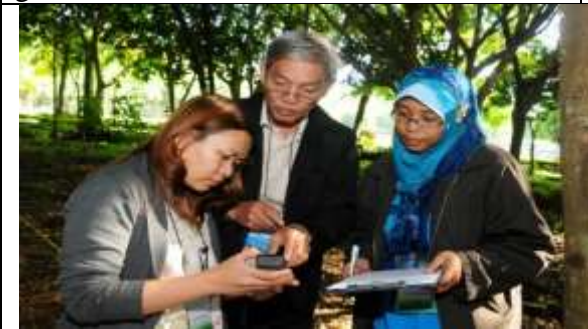
Picture 3: The trainers were trained on how to use the GPS to get the location