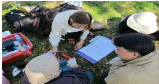
Picture 4: The trainers learn how to use the apparatus to measure the quality of the water