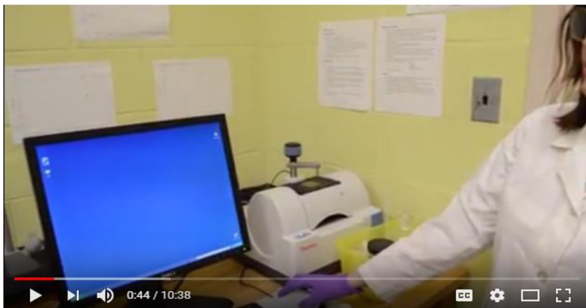
Figure 1. FTIR Analysis (FTIR Spectroscopy) (Labtesting, 2013).

Instructional Video. An instructional video shows step-by-step procedures or instructions of how to use or control or handle some equipment. As an example, Figure 1 illustrates a teacher is describing how to use an FT-IR or UV-Visible spectroscope or any related apparatus that needs extra precaution to handle in a university course called "spectroscopy". The instructions given in video form include steps or procedures to prepare samples, type of sample that is suitable to run on the precise apparatus and what result to expect.