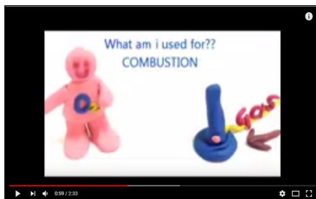
Figure 4. Oxygen (Sandaram et al., 2016).

By making and creating the learners' own video, publishing and sharing it with the public, this activity also helps members of the general public to feel closer to science as well as to make science easier to learn and apply. It is evident from a study that video making is a means of engaging students in the propagation and explanation of science. They enjoy themselves and become creative. It can increase open appreciation of chemistry as an important instrument or mechanism to satisfy the needs of a society, to develop young people's keen interest in studying science, and to breed passion for its creative future (Burke, Snyder, & Rager, 2009).