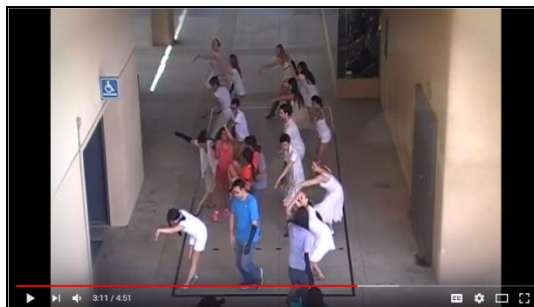
Figure 3. Thin Layer Chromatography-Dancer Version (DanceChemistry, 2013).

This activity implements the pedagogical approach through chemistry learning incorporating art in dance in order to facilitate student's visualization of an abstract concept. For those involved in the dance activity, it assisted the students to extensively discover the role of the characters they embodied in the process. They also learned about another character performed by their friend, how to react, when to react and why to react. They are able to be exposed to and learn deeply about the concept illustrated in the video. Those who are watching the video clip will also be helped to visualize (or develop strong meaning to) the concept and get a picture of how the process occurs. It shows that both participants in this activity get advantages. It is challenging for its developer to design an interesting storyboard that attracts students' attention and focus. Hence this type of video should add notes and provide a narrator to facilitate real understanding and achievement of effective learning.